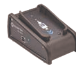
SB 104B-1 Docking station for 1 dosimeter