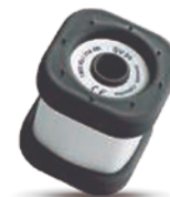
SV 34B Class 2 acoustic calibrator 114 dB at 1 kHz