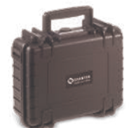
SA 147B Waterproof carrying case for dosimeter and docking station