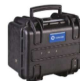
SB 275 External 33 Ah Battery