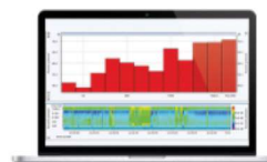
SF 307_3 License of 1/1 & 1/3 octave