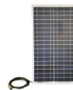
SB 371 Solar Panel