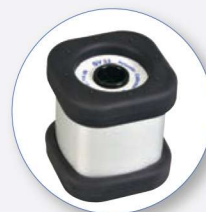
SV 36 Class 1 Acoustic Calibrator 94 dB / 114 dB at 1 kHz