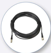
SC 26 Extension Cable for Preamplifier