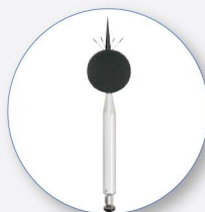
SA 277C Microphone Outdoor Protection Kit