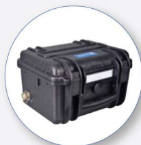
SM 277 PRO Outdoor Monitoring Case