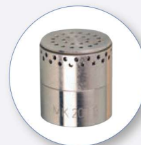
SV MK202E Ultrasound Microphone up to 40 kHz band