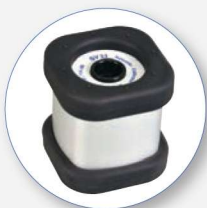
SV34 Class 2 Acoustic Calibrator 114 dB at 1 kHz