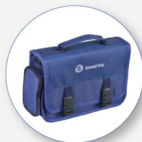
SA47M Carrying Bag Fabric Material