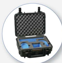
SA 147 Waterproof Carrying Case