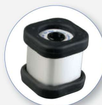
SV 34A Class 2 Acoustic Calibrator