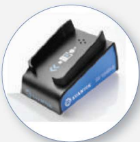
SB 104B-1 Docking Station for Single Dosimeter