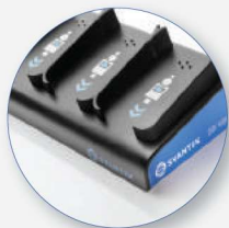
SB 104B-5 Docking Station for 5 Dosimeters