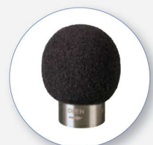
SA 122A Spare Windscreen